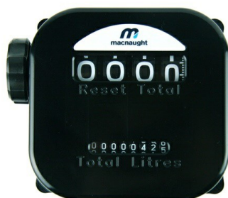
HEAVY DUTY MECHANICAL DISPLAY